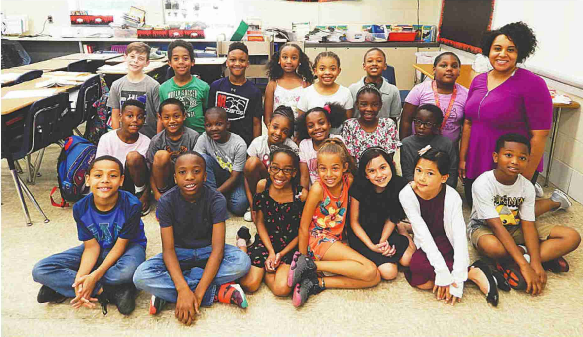
YORKTOWN ELEMENTARY SCHOOL